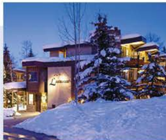
LAURELWOOD CONDOMINIUMS 1-800-356-7893 FROM $236/NT