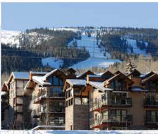
CRESTWOOD CONDOMINIUMS 1-800-356-5949 FROM $273/NT

Conference headquarters for Aspen Anesthesia! Rated best ski hotel in the nation by USA TODAY , modern luxury and specialized service abound at this beautiful ski-in, ski-out resort at the base of Snowmass. The luxurious Viceroy offers breathtaking mountain views, elegant amenities, in-room kitchens, fireplaces, two excellent restaurants and a coffee shop, and unparalleled hospitality. Soothe your muscles in the slopeside heated pool and hot tubs, or find sanctuary at the decadent Ute Indian-inspired wellness spa. Special group amenities include discounted room rates (the standard rate is $645+/nt), spa discounts, and a discounted $15 daily resort fee (regularly $40) that includes Wi-Fi in guests rooms and meeting room, fitness studio access, daily newspaper, coffee and espresso in rooms, courtesy Aspen airport and Snowmass Village transportation, and more. Book your stay today, as the Viceroy will fill up fast!