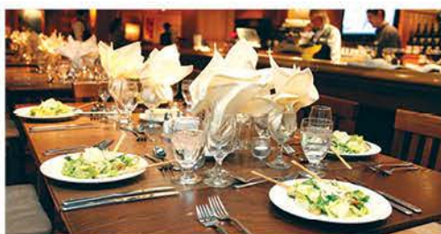
Alumni Dinner (10 or More Years Attendance)