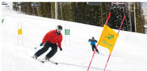
Complimentary Nastar Races (for Registrants and Family)