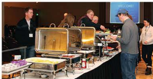
Delicious Breakfast – Each Morning (Registrants Only)

Discounts on ski lessons, restaurants, car rentals, snowmobiling, merchandise, and more. See our website for full details, www.HolidaySeminars.com .