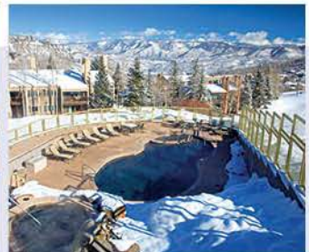
TIMBERLINE CONDOMINIUMS 1-800-922-4001 FROM $268/NT

Visit HolidaySeminars.com for More Lodging Options.