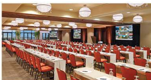
Ski-In, Ski-Out Conference Room