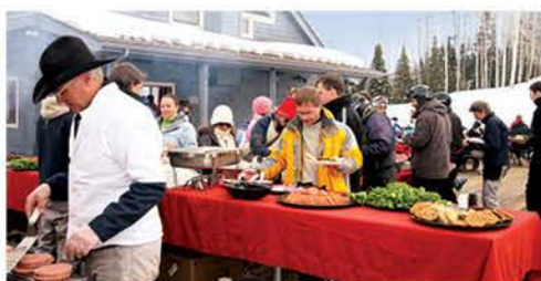
Group Picnic on the Mountain (Free for Registrants)