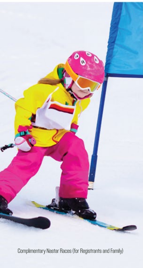
Complimentary Nastar Races (for Registrants and Family)

Below are some of the fantastic extras you get when you choose Holiday Seminars' Aspen Anesthesia!