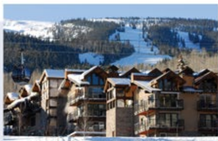
CRESTWOOD CONDOMINIUMS 1-800-356-5949 FROM $273/NT

Conference headquarters for Aspen Anesthesia! Rated best ski hotel in the nation by USA TODAY , modern luxury and specialized service abound at this beautiful ski-in, ski-out resort at the base of Snowmass. The luxurious Viceroy offers breathtaking mountain views, elegant amenities, in-room kitchens, fireplaces, two excellent restaurants and a coffee shop, and unparalleled hospitality. Soothe your muscles in the slopeside heated pool and hot tubs, or find sanctuary at the decadent Ute Indian-inspired wellness spa. Special group amenities include discounted room rates (the standard rate is $600+/nt), spa discounts, and a discounted $20 daily resort fee (regularly $45) that includes Wi-Fi in guest rooms and meeting room, fitness studio access, daily newspaper, coffee and espresso in rooms, courtesy Aspen airport and Snowmass Village transportation, and more. Book your stay today, as the Viceroy will fill up fast!