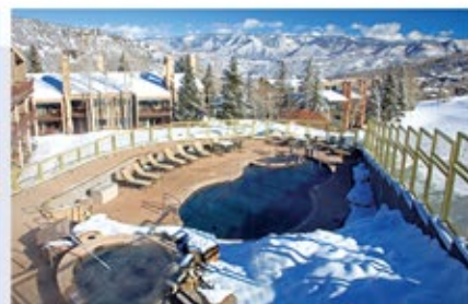
TIMBERLINE CONDOMINIUMS 1-800-922-4001 FROM $273/NT

Visit HolidaySeminars.com for More Lodging Options.