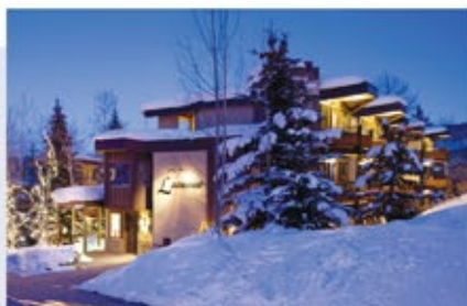
LAURELWOOD CONDOMINIUMS 1-800-356-7893 FROM $229/NT