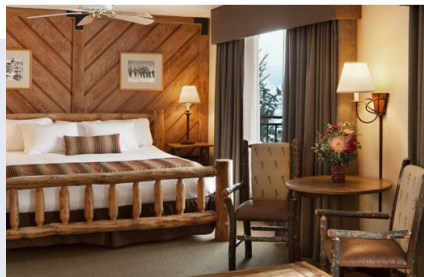
STONEBRIDGE INN 1-844-330-1859 10% Off Rates