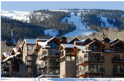
CRESTWOOD CONDOMINIUMS 1-800-356-5949 FROM $319/NT

Conference headquarters for Aspen Anesthesia! Rated best ski hotel in the nation by USA TODAY and #1 resort in Colorado by Travel + Leisure , modern luxury and specialized service abound at this beautiful ski-in, ski-out resort at the base of Snowmass. The luxurious Viceroy offers breathtaking mountain views, elegant amenities, in-room kitchens, fireplaces, two excellent restaurants and a coffee shop, and unparalleled hospitality. Soothe your muscles in the slopeside heated pool and hot tubs, or find sanctuary at the decadent Ute Indian-inspired wellness spa. Special group amenities include discounted room rates (the standard rate is $799+/nt), spa discounts, and a discounted $25 daily resort fee (regularly $50) that includes Wi-Fi in guest rooms and meeting room, fitness studio access, coffee and espresso in rooms, courtesy Aspen airport and Snowmass Village transportation, and more. Book your stay today, as the Viceroy will fill up fast!