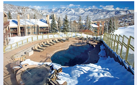
TIMBERLINE CONDOMINIUMS 1-800-922-4001 FROM $327/NT

Visit HolidaySeminars.com for More Lodging Options.